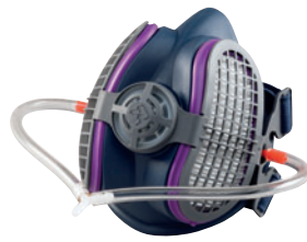
Quantitative Face-Fit Test Kit shown installed on LPR-100