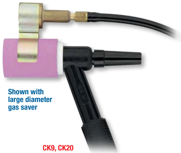
Shown with large diameter gas saver