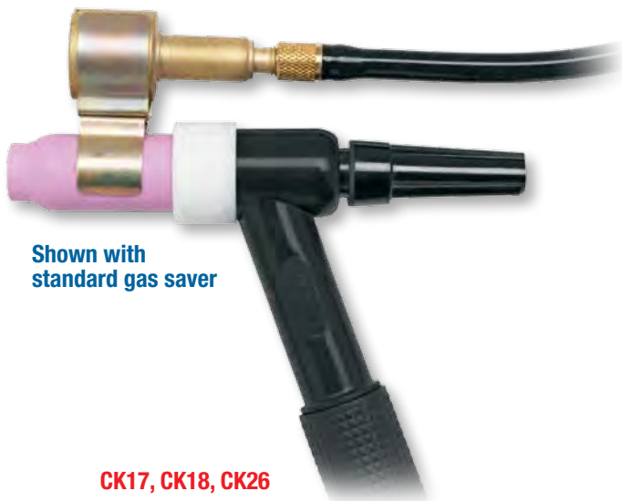
Shown with standard gas saver