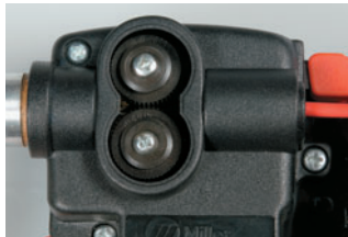
Dual V-knurled drive rolls for consistent feeding.