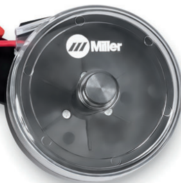
Clear spool cover allows the user to see the amount of wire left before it runs out.