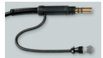
20-foot (6.1 m) direct-connect cable with heavy-duty strain relief.