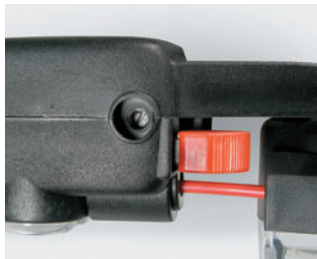
Adjustable drive roll tension for feeding different types of wire. Adjustable pressure lever for easy loading and unloading of wire.