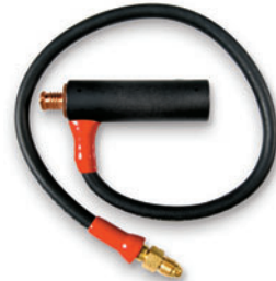
225028 50 mm thread-lock-style for water-cooled torch.