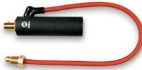
195377 50 mm Dinse-style with water return line for water-cooled torch.