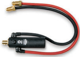
195380 50 mm Dinse-style gas thru with gas and water return lines for water-cooled torch.