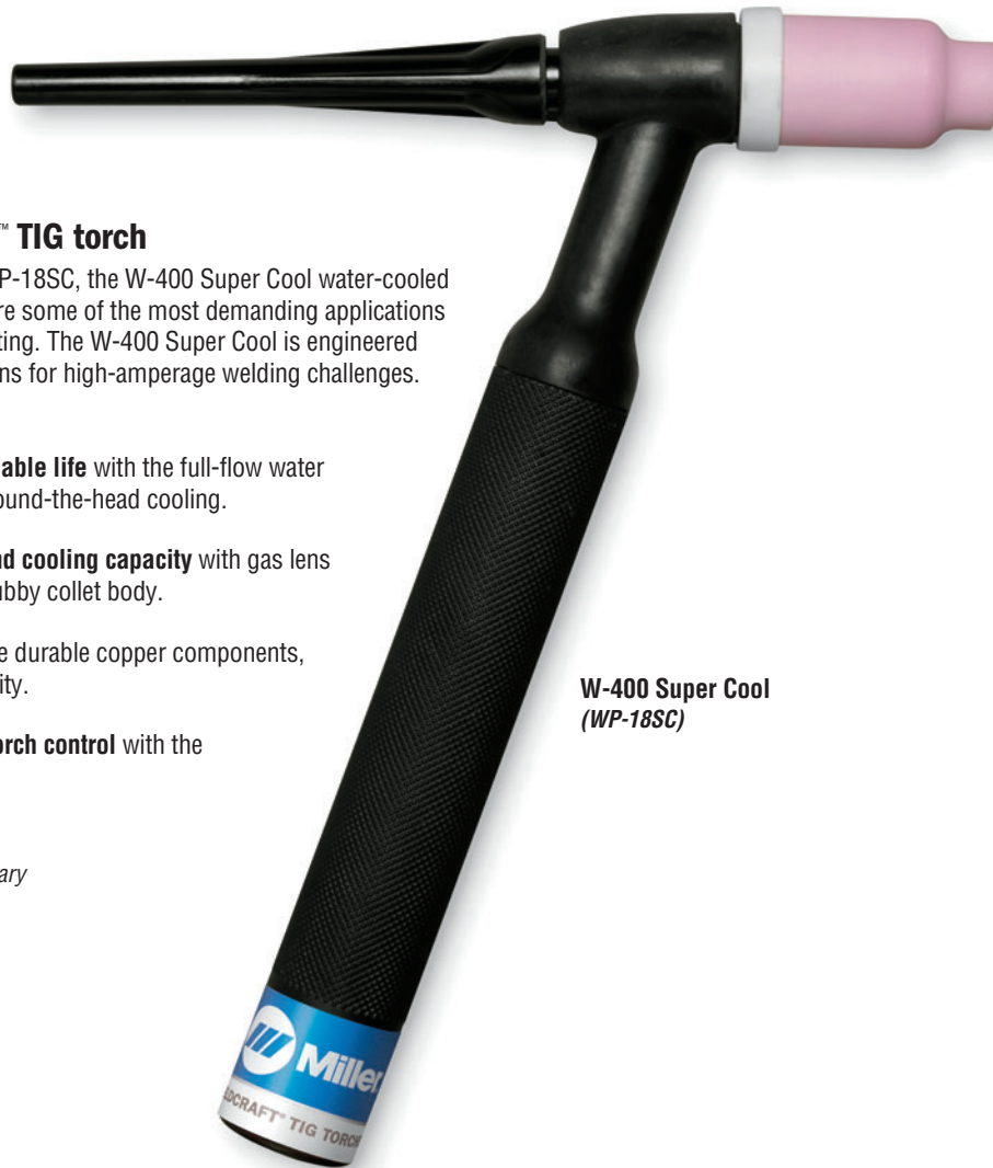
W-400 Super Cool (WP-18SC)