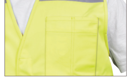
Four pockets on left chest hold pencils, markers and other small items.

"X" PATTERN alerts others to when wearer's back is turned