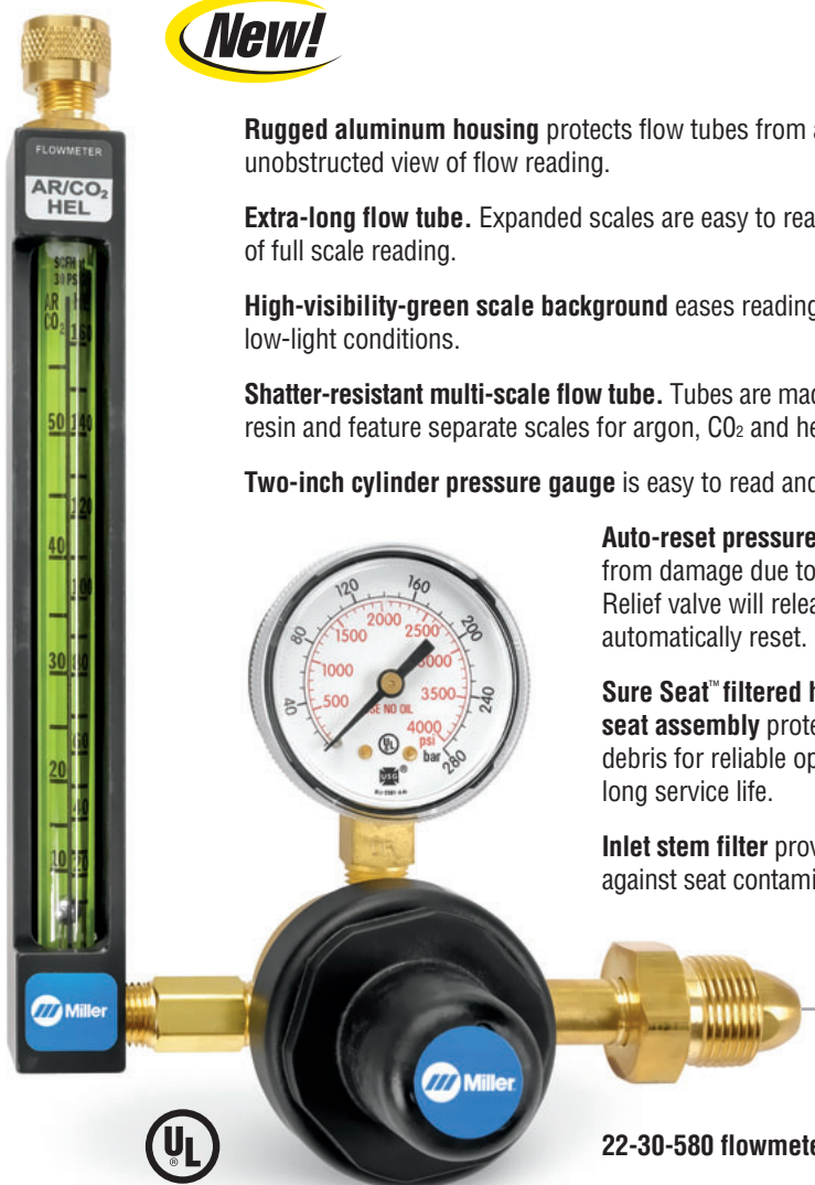
22-30-580 flowmeter regulator shown.