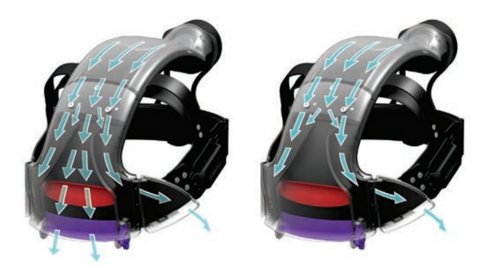
First baffle (Red) - controls ratio of air over forehead vs temples

Two air flow baffles allow users to adjust the air for maximum comfort and prevent drying of the eyes.