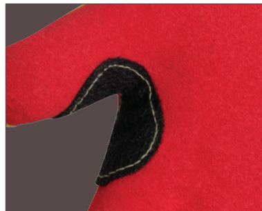
Thumb patch provides extra durability