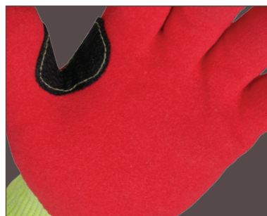
Sandy nitrile palm coating improves grip