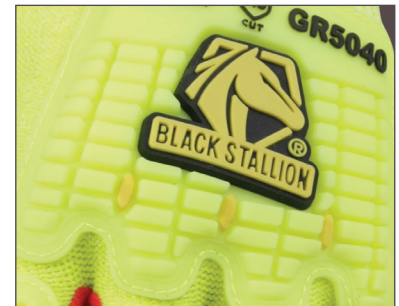
TPR pads protect back of hand and fingers