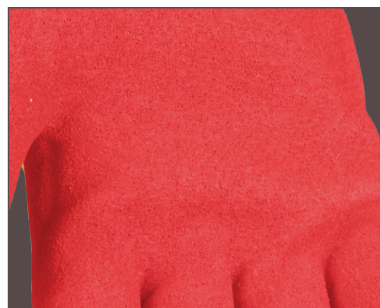
Sandy nitrile palm coating improves grip