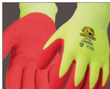
Hi-vis back & palm improves safety