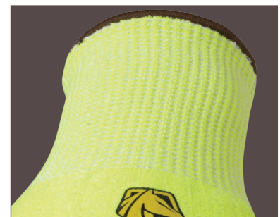
Seamless knit cuff for a comfortable fit