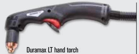
Duramax LT hand torch