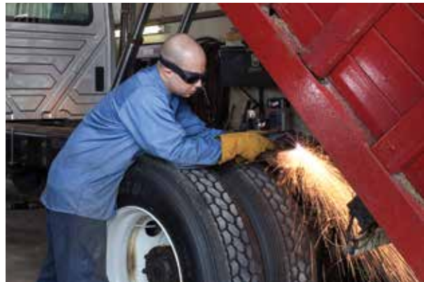
Vehicle repair and modification