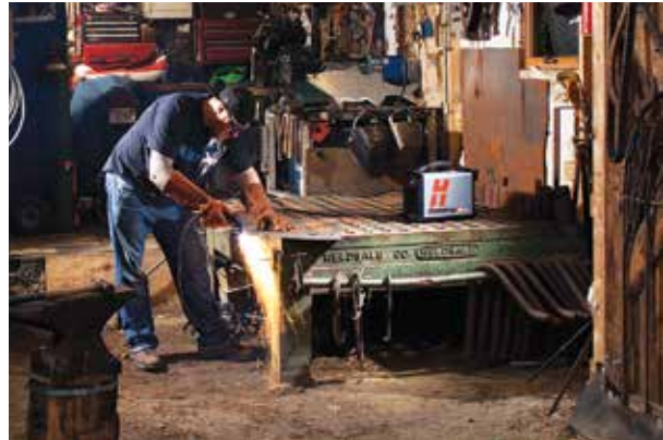
Home hobby and metal art

HVAC, agricultural, property/plant maintenance, fire and rescue, general fabrication, plus: