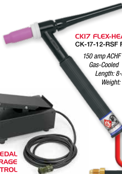
CK17 FLEX-HEAD TORCH CK-17-12-RSF FX

150 amp ACHF or DCSP @ 100% Gas-Cooled Length: 8-3/4" (22.2cm) Weight: 5 oz. (141gm)