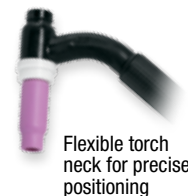
Flexible torch neck for precise positioning

150 amp ACHF or DCSP @ 100% Gas-Cooled Length: 8-3/4" (22.2cm) Weight: 5 oz. (141gm)